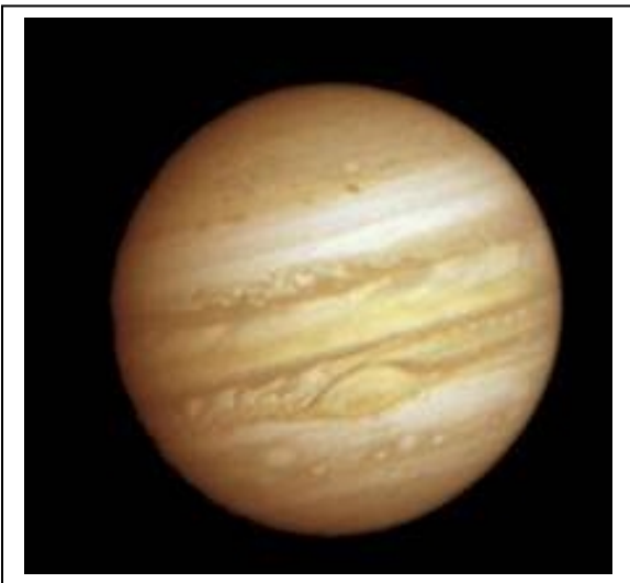
Jupiter is visible after 10:00