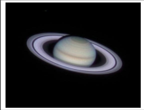
Saturn is visible after dark