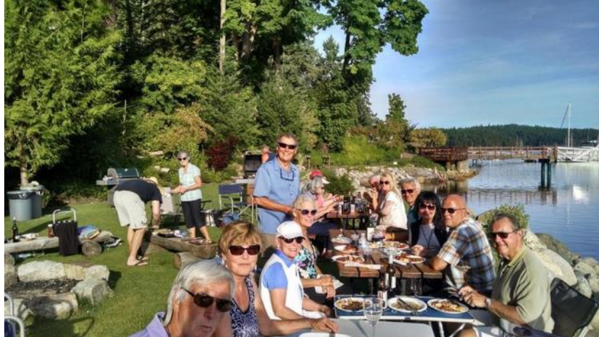
On the Move, Desolation Exploration. August 7-13, 2014

For those that did not make this cruise, your loss!