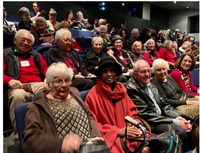
VSMC members waiting for the curtain to rise

Forty VSMC members on their way to attend the San Francisco performance of Smuin Christmas Ballet