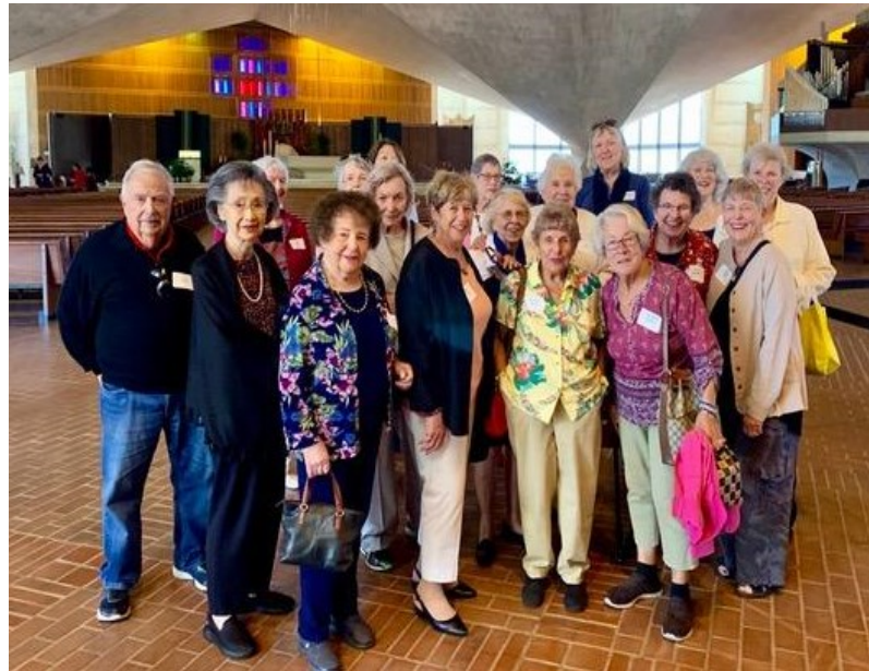
A visit to Grace Cathedral