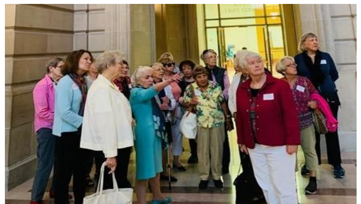
A docent-led tour of San Francisco City Hall