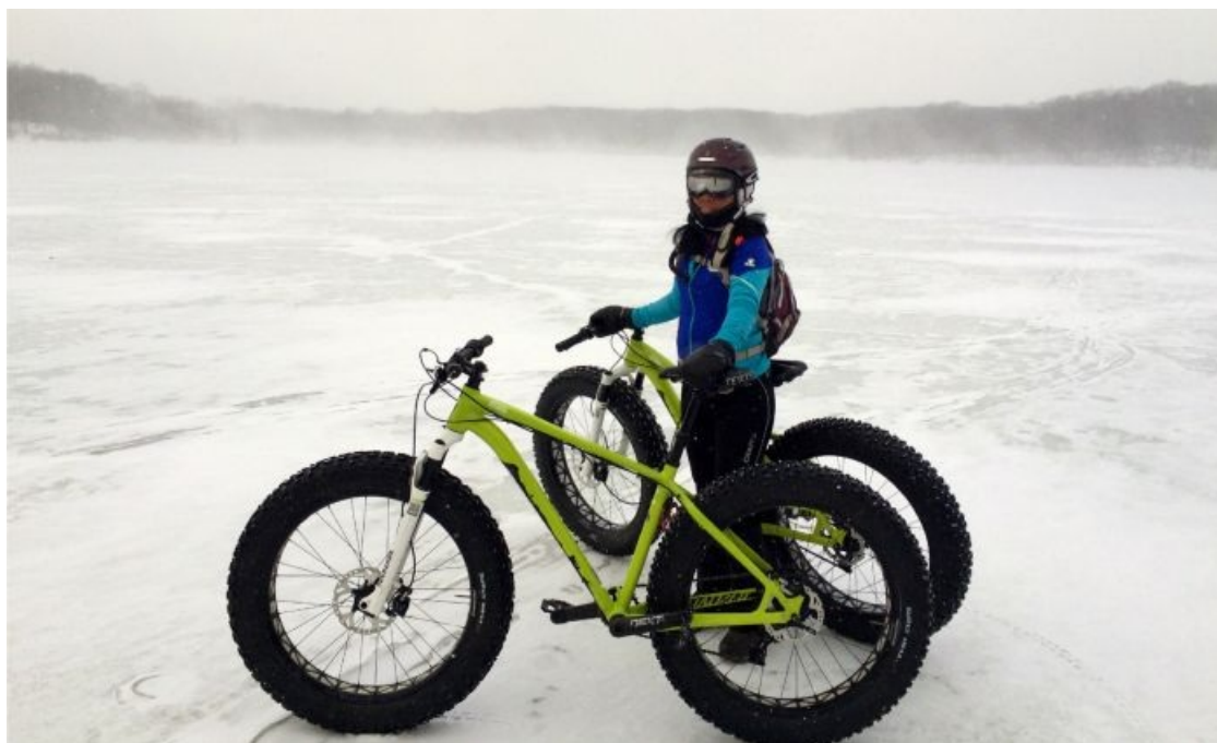
Winter Lake Riding!