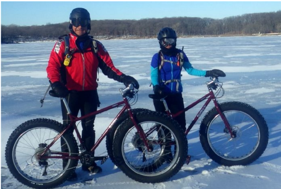
Properly Dressed Winter Cyclists!

This is a winter dress guide for cyclists that has been battle tested by Pussanee and me. ..We both hate to be cold and unlike me...she has a scant amount of body fat to insulate her. This is just an example of what works for Pussanee and me. There are many good ways to stay warm riding all year and everyone has a different internal thermostat and cold tolerance, but this article will give you a good general starting point. Most of these tips also work well for Snowshoeing and XC skiing.