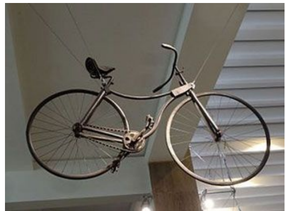
The "safety bicycle"!

The bicycle evolved into something that we would recognize as such in the 1880s. John Kemp Starley produced the first "safety bicycle." It had equally sized wheels and a chain drive to the rear wheel. John Dunlop's pneumatic bicycle tire in 1888 made biking more comfortable. The "safety bicycle" was suitable for women and Susan B. Anthony called it the "freedom machine."