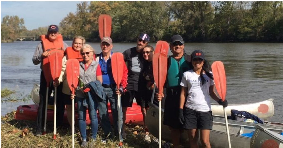
Canoeing the Fox River! Shorts and Short Sleeves in October!