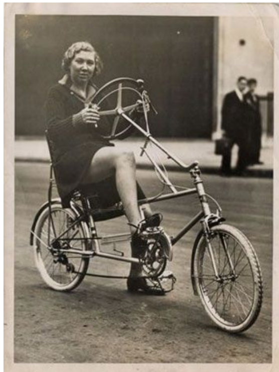
The "early recumbent"!

https://en.wikipedia.org/wiki/History_of_the_bicycle .