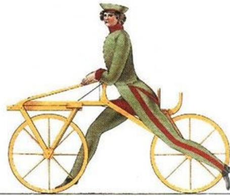
The "running machine"!

Frenchman Eugene Meyer is regarded as the father of the high-bicycle, also known as the penny-farthing. He invented the wire-spoke tension wheel in 1869 and after that produced a classic high-bicycle design until the 1880s.