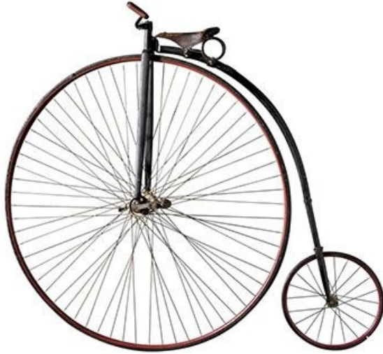
The "penny farthing"!

Frenchman Eugene Meyer is regarded as the father of the high-bicycle, also known as the penny-farthing. He invented the wire-spoke tension wheel in 1869 and after that produced a classic high-bicycle design until the 1880s.