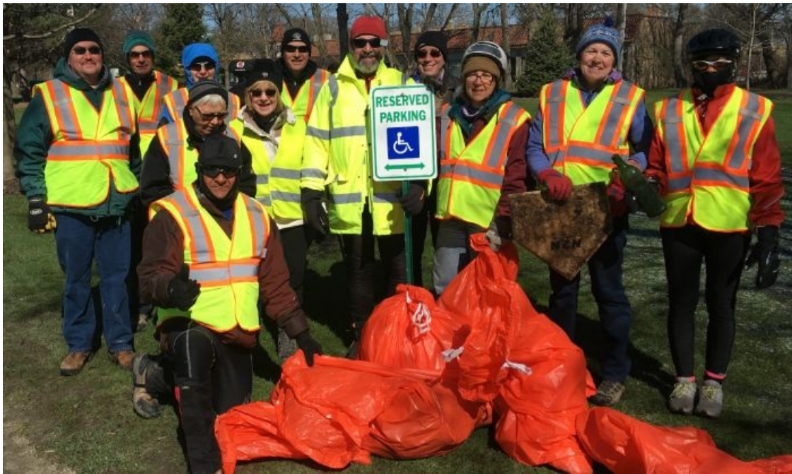
Crisp and cool (ok - down right cold), but sunny! EBCers brought their own sunny disposition!