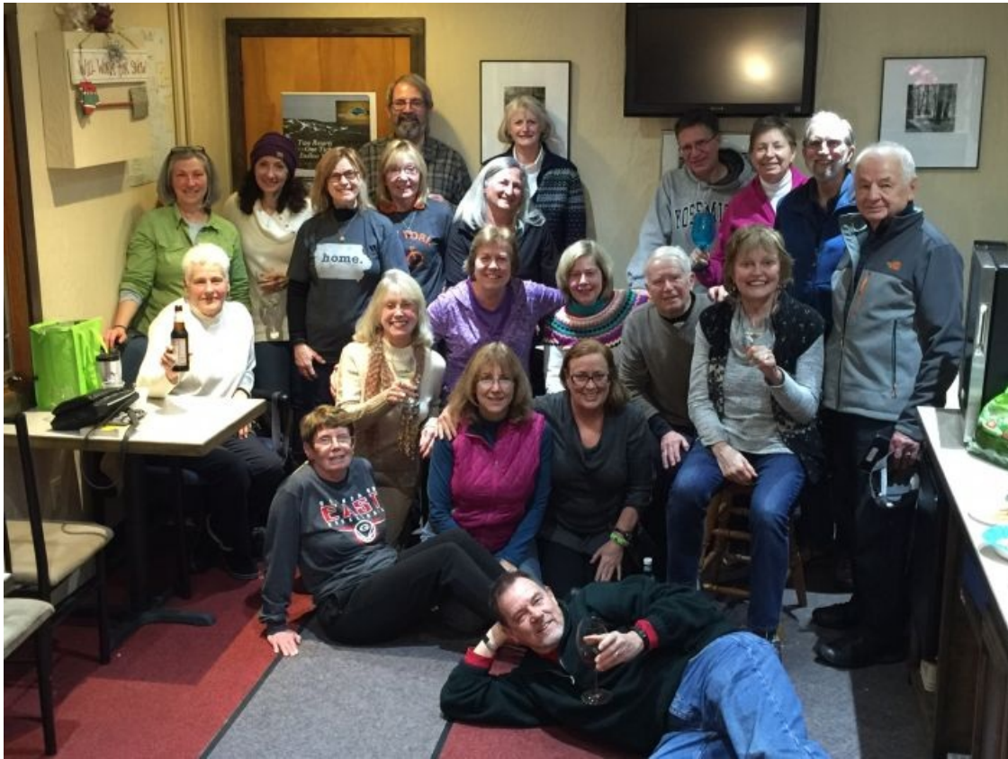
Many of the usual suspects enjoy evening get-together at Indianhead Motel.

The weather was balmy than what is normal for the area, roughly mid-20s for most of the days. I get cold easy, so I had layer after layer on. Looking like Mrs. Abominable Snowman, I peeled off the layers each day, as I got more acclimatized and comfortable with the brisk air.