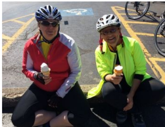
Oooohh!! Dairy Queen!!