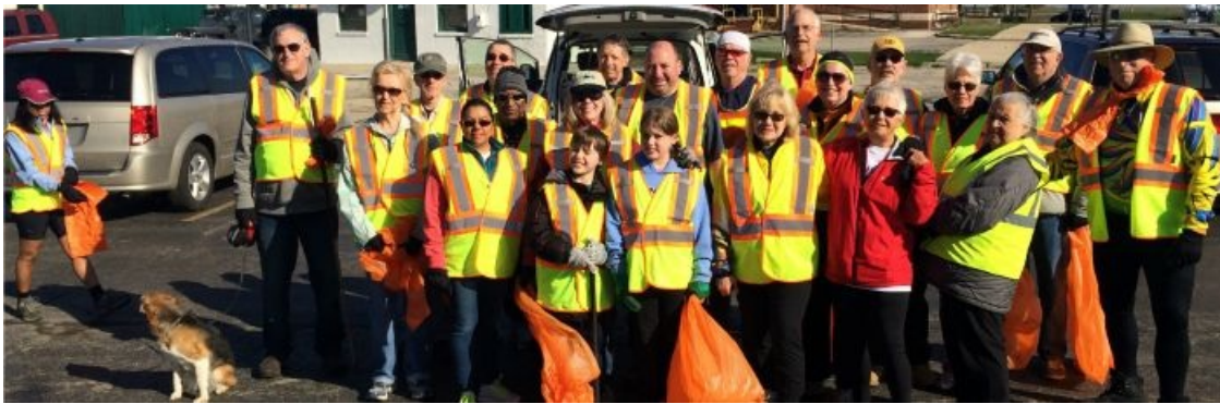
EBCers turnout for IPP cleanup!