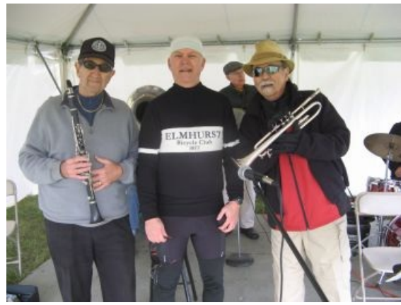
Could I be guilty of blowing my own horn?

Rest stops are plentiful (typical as with most invitational rides) with plenty of snacks, food, water, and porta-potties. Deserving special mention are the enroute chicken dinners at the mid-point rest stop each day. No one is going to go hungry. Several of the rest stops on Saturday and Sunday have live music. Blue grass, country and western, and some 'rock' are sure to entertain. At the high school marking the start and end of the ride, a huge tent is erected with dozens of vendors hawking bicycles and bicycle-wares. Parts, tubes, tires, clothing, mirrors, shoes, helmets, and on and on - they are all present. The weather in early October can range from down-right chilly to surprisingly warm, but in the last five years I'd say it generally starts out cool in the morning (low 40's) to mid-50's later. For more information about topography, try either of the next 2 links: Indiana Topography. Karst formations and the Mitchell Plateau