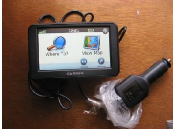
Garmin Nuvi 40LM car plug-in cord!

I'm not sure how many EBCers have Garmin devices that they take with them (or mount on their bicycles) when they ride, but I know there are some. I don't have one that I take along when riding myself, but I do have an inexpensive model (Nuvi 40LM) that I have used in the car for several years. I paid the extra $20 for lifetime map updates when I purchased it, but have never been able to get the map updates to be loaded on to the device via my personal computer. My device now routinely reminds me that its maps are out-of-date. While I've not experienced a real problem because of the out-of-date maps, I thought I should try harder to get them updated.