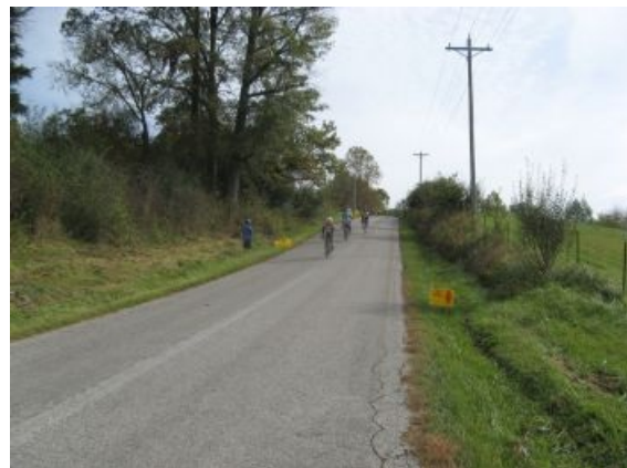
Flying down the hill!