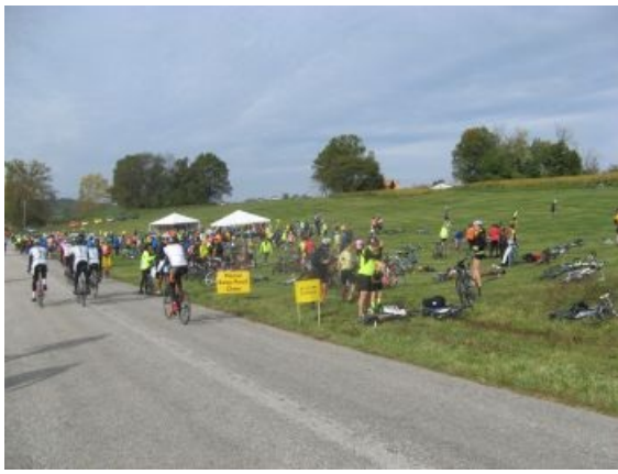
Chicken Dinners will fill you up!