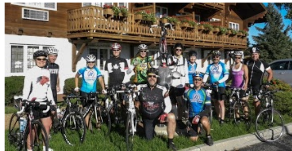
Members from NBC and EBC, New Glarus, WI