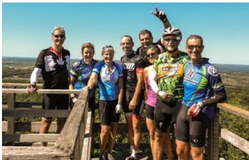
At top of Blue Mound observation tower! Could the weather be better?

There was an antique car show in town over the weekend and several of the owners were staying at the Chalet Landhaus. We were able to admire the beautiful old cars and even folks dressed in period clothing on Saturday.