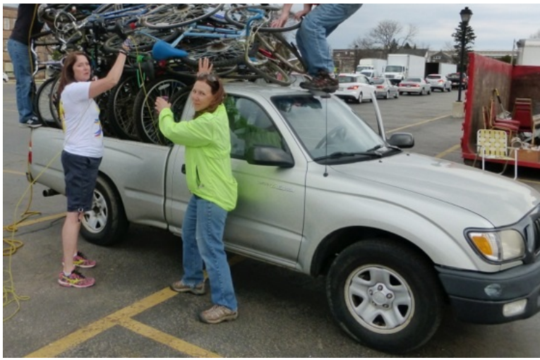
How many bicycles can you stack in a small truck?