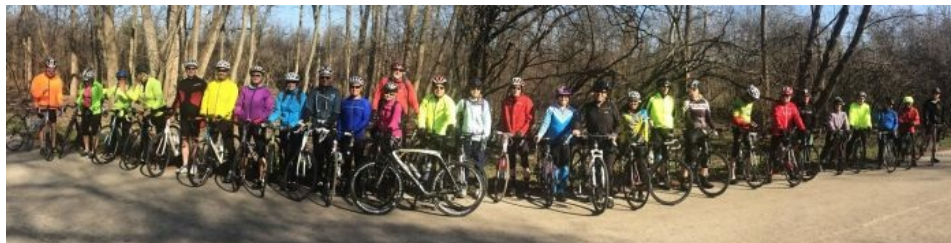
29 Riders - Hill Training #3