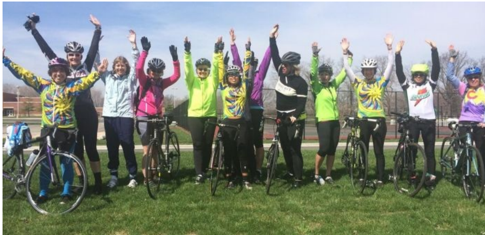
Love these EBC gals!