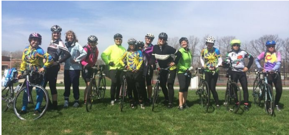
EBC Women Rock!