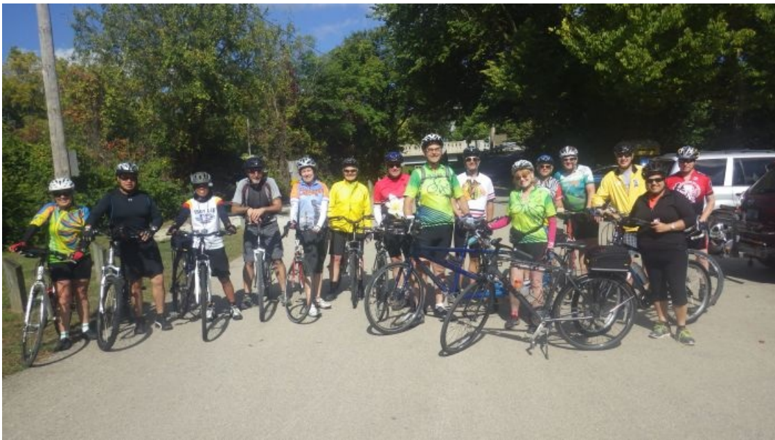
With perfect weather on a Sunday afternoon, there were plenty of riders!

The Corn Festival is a pure slice of Americana.... One of the largest Parades you will see anywhere....it runs almost 3 hours, plus the food.....Pork Chops on a Stick, Corn dipped in Gigantic Vats of Pure Butter, Fried Dough, Funnel Cakes, Grilled Chicken, Steak, Beer, Turkey legs.....you know.....the good stuff :)