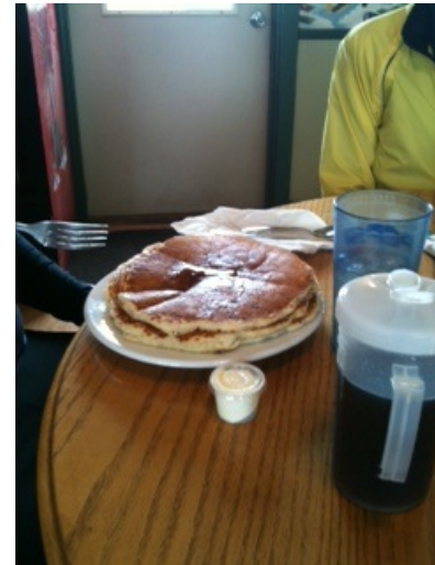
The pancakes look pretty good! Larry had to keep his strength up in order to tackle those hills!

Larry Gitchell led our riding group on a rain-free ride through a northern route. The highlight of the ride was our lunch stop at a small local airport that has a small cafe. We have biked by this airport in previous visits, but never had ventured inside. The place had only one other couple eating there at the time, but as soon as the couples' plates were delivered, we knew what we all had to order - the potato chips made by making a spiral cut and then frying them! They were spectacular! After eating, we made our way back and had several hills that are typical of the Spring Green area - with grades in the 10% range.