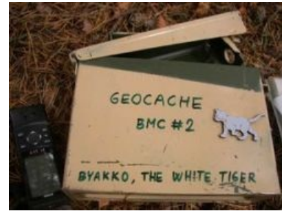
Ammo Can as Geocache