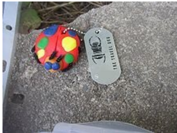
A Travel 'Bug.'