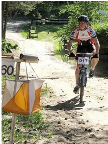
Mountain Biker on Geocache Course