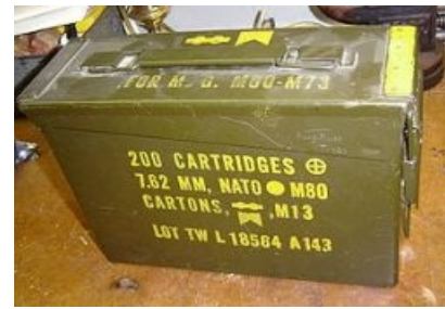
An ammunition box for NATO cartridges

such as plastic storage containers (tupperware or similar) or ammo boxes can also contain items for trading, usually toys or trinkets of little value. Geocaching is often described as a "game of high-tech hide and seek," sharing many aspects with benchmarking, trigpointing, orienteering, treasure-hunting, letterboxing, and waymarking. Geocaches are currently placed in over 100 countries around the world and on all seven continents, including Antarctica. After 10 years of activity there are over 1.2 million active geocaches published on various websites devoted to the activity.