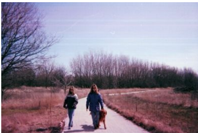
Dog walkers along Greene Valley Forest Preserve Trail

With the completion of this route, the temporary route which was previously signed along Quincy and Executive was removed and signage installed along the permanent route.