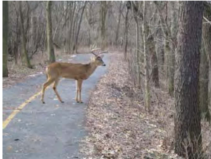
A TYPICAL BUSSE WOODS PEDESTIAN.

spokes@spokesbikes.com www.spokesbikes.com