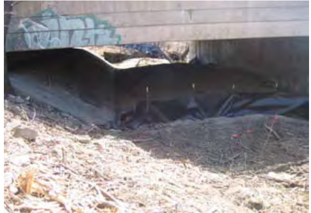
SALT CREEK TRAIL UNDERPASS AT ST. CHARLES ROAD.

Construction of Elmhurst's portion of the trail is currently underway as contractors and surveyors have begun staking out the trail, removing trees, installing silt fences, and constructing trail bridges. Once construction begins, the existing wood chip from Madison