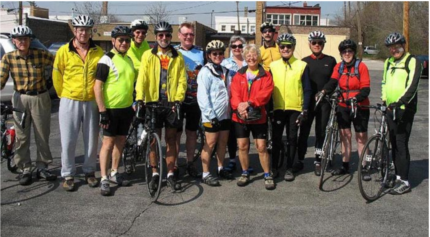
Above: Riders for Ben and Jerry's ice cream. Below: A walk in the woods for fresh aire and photos of wild flowers, though no wild hikers or bicyclists.