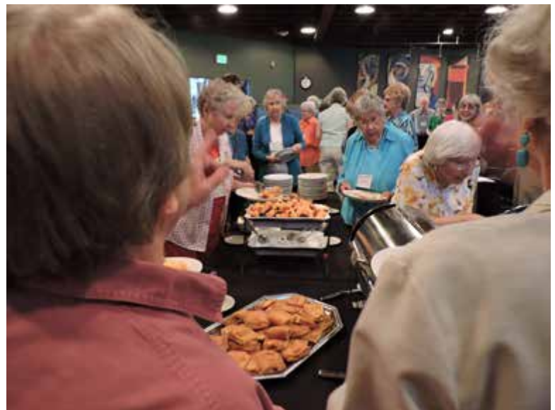
Breakfast buffet at the Annual Meeting. 6 May 2017

Thank you to everyone who attended and helped us celebrate the great work of LWVBC in 2016 - 17!