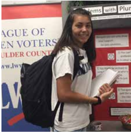
Introducing LWV to young voters and potential members at Front Range Community College.

Membership in LWV means you've joined thousands of women and men of all ages, all over the U.S., to speak with one voice on critical policy issues at all levels of government. You help lift up the value of thoughtful, well-researched analysis that rises above party politics and encourage civic engagement among all people Boulder County, and our state.