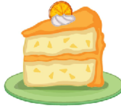
Lemon Cake 38%