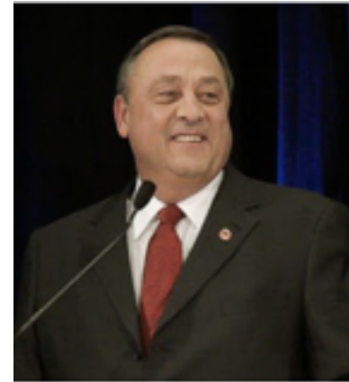
Paul LePage Republican