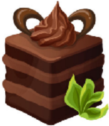
Chocolate Cake 19%