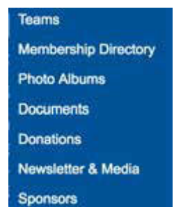
Member Info Pulldown Menu

Check back often – we will be adding items and features and making our information more useful. We welcome suggestions.