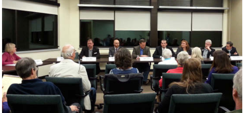
State Legislative Candidate Forum 13 October 2016, at the Via Hoover Family Conference Center, Boulder

Check the Calendar on our website for a complete listing of planned events.