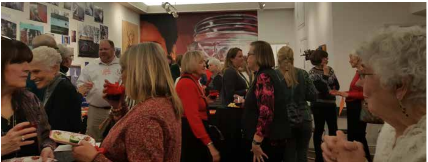
LWVBC Holiday Wine & Cheese Party, Firehouse Art Center, Longmont, 2 December 2016.

In early December, we tried a Holiday Wine and Cheese Party at the Firehouse Art Center in Longmont. It was a great success! Everyone had fun and networked with members and guests as we socialized and celebrated all the great work our League did during the election season. We had 33 LWVBC members and 21 guests, and many donations, including wine, food, and door prizes. Thank you to all who helped and made donations.