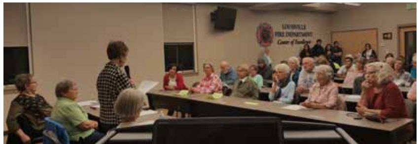
Community Conversation: Non-Citizen Rights, 15 November 2016, at the Louisville Fire Dept, Louisville

League of Women Voters of Boulder County Box 21274, Boulder CO 80308 www.lwvbc.org