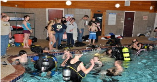
Discover Re-breathers Session in the Pool

Discover Scuba and Re-breathers is very Popular