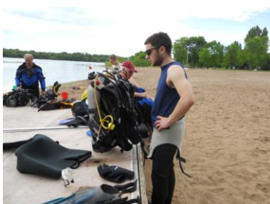
Putting together the dive equipment and wet suits