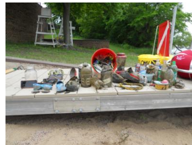
Some of the debris found on the lake bottom