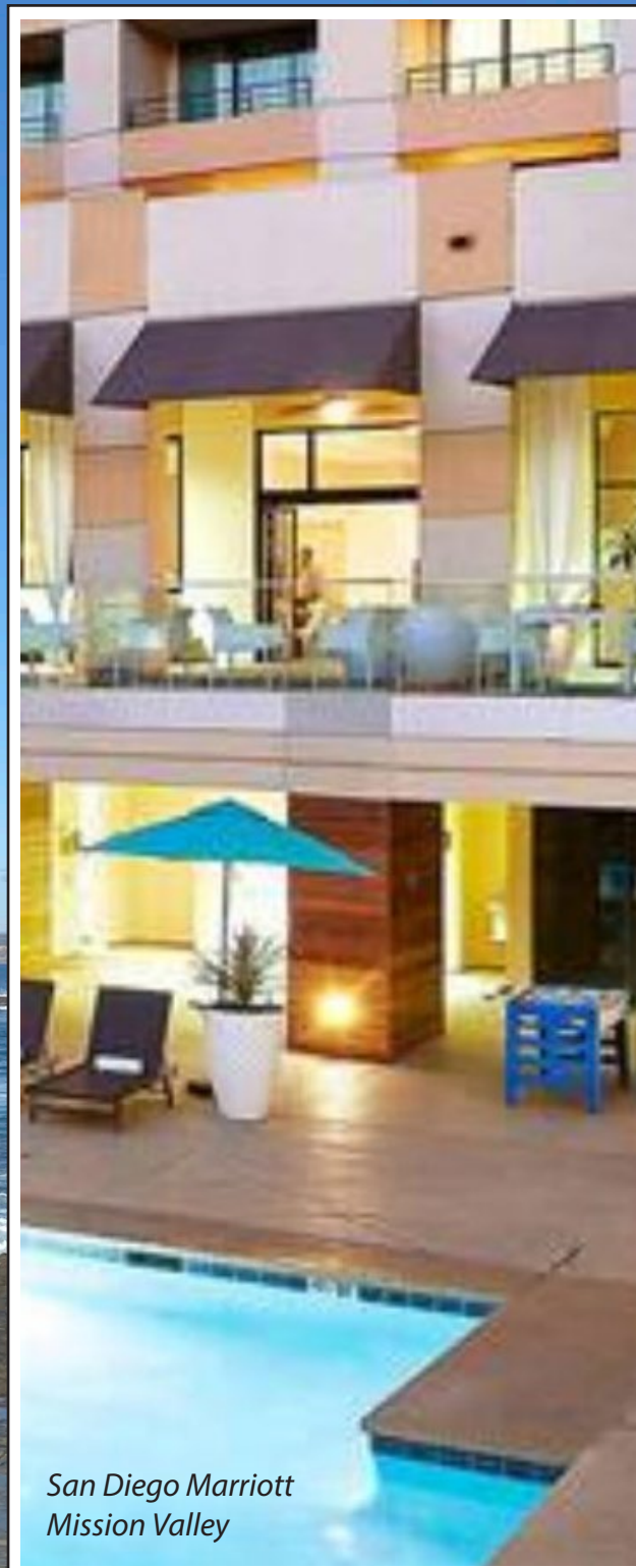
San Diego Marriott Mission Valley