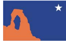
#33 Score = 8.2