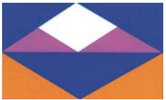
#20 Score = 6.3