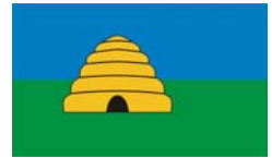
#17 Score = 7.6