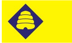
#1 Score = 9.1

If for any reason the SLT wishes to substitute designs into the ten it presents to readers, these ten followed the top designs. These represent designs selected by judges highest in their “top ten” choices after their “top two”.