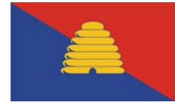
#35 Score = 8.5