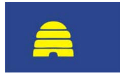
#32b Score = 9.7