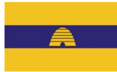
#15 Score = 8.3