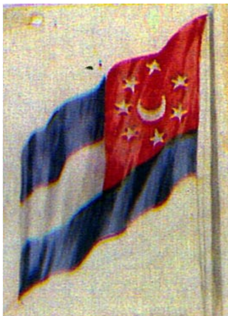
Figure 5. George and Catharine Ladd's Flag. From the Archives of the Committee on Flag and Seal

The Ladd proposal differs from the adopted Confederate flag in two particulars. The most glaring is the reversal of the red and blue colors. This was a feature proposed by six others who submitted flag proposals, five with 13 stripes and one with 7 stripes. No other submission, however, included a canton and only three stripes or bars in either the traditional American color arrangement or the reversed colors suggested by Mr. Ladd.