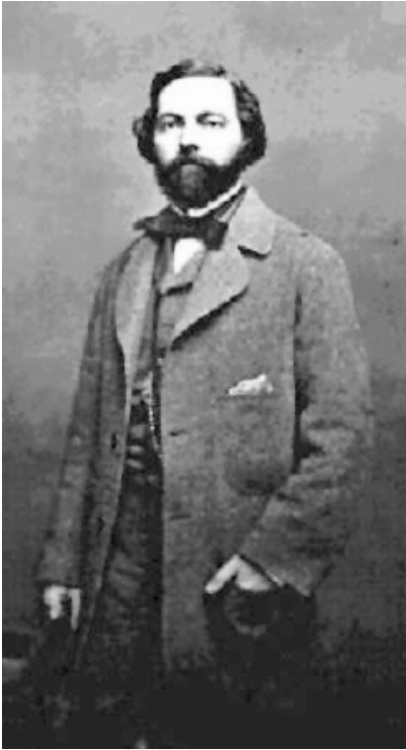
Figure 1. Congressman William Porcher Miles, Chairman of the Confederate States Congressional Committee on Flag and Seal

submitted by about 130 people. Several were sent from states that had not yet seceded, and two were sent from Northern states, one from Philadelphia and one from Brooklyn, New York. 7 The number of designs, and the various sources of delivery to the committee's attention, were such that on 16 February 1861 Miles felt compelled to state on the floor on the Congress