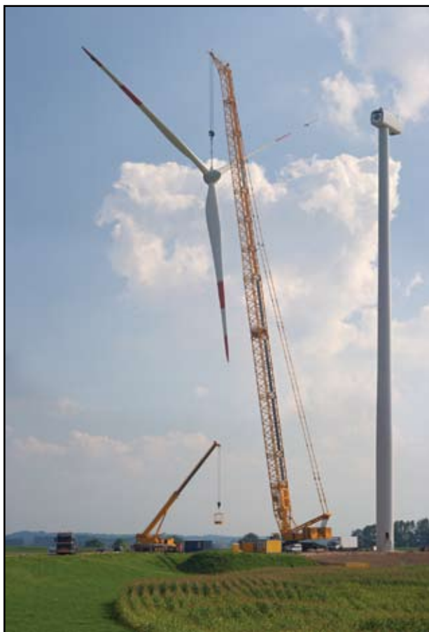
SURFACE RIGHTS ARE NOT AUTOMATIC in wind leases. Unlike mineral leases, which permit the lessee to use as much of the surface as is necessary to produce minerals, wind leases specify compensation for and restrictions to most surface uses.

Indemnification. The lessee should indemnify and hold the landowner harmless from any lawsuits, judgments, unpaid bills and environmental claims caused by its operations. Wording is crucial, primarily to ensure compliance with the