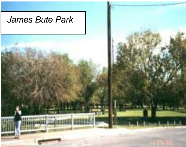
James Bute Park

Today, no residences exist in Frostown. A couple of the old streets still remain, but most of the area is part of the complex of freeways and overpasses comprising Highway 59 and the Elysian Viaduct. Harris County has preserved the memory of Frostown in the creation of James Bute Park. Frostown and James Bute Park lie on the south side of Buffalo Bayou at the McKee Street bridge. This bridge is about one mile downstream of Allen's Landing. Access to Buffalo Bayou will be possible from Allen's Landing Park at the foot of Main Street, although the park is currently being redeveloped and is under construction.