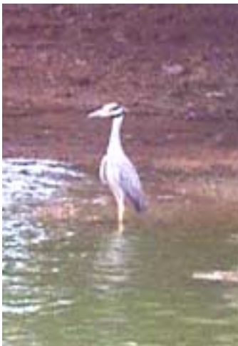
Yellow-Crested Night Heron