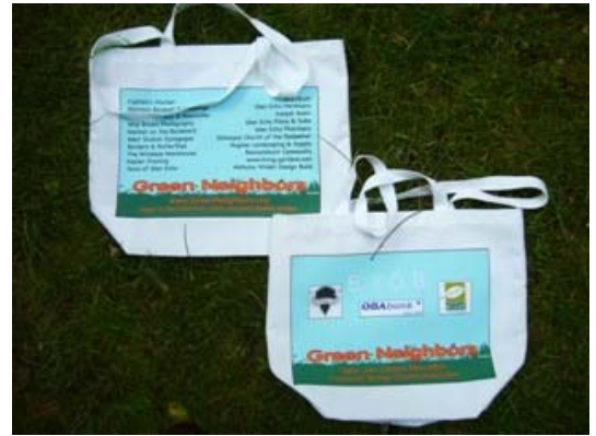
GN Recycling bags with names of local business sponsors