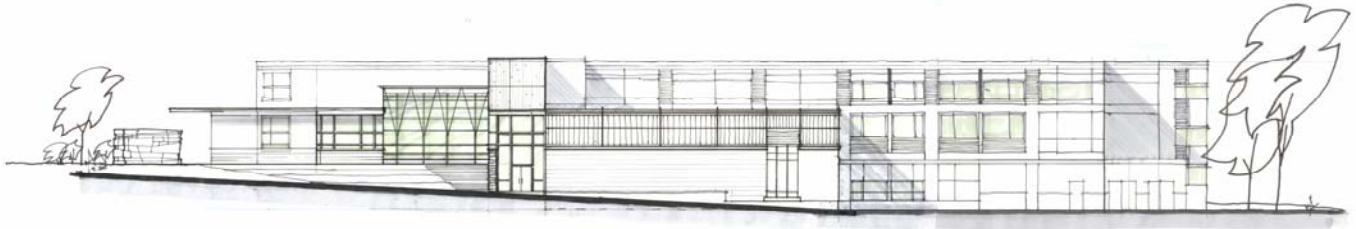
New Carderock Springs Elementary School, coming 2010

Generations gathered in late August to say farewell to the old Carderock Elementary School building - by circling it and giving it a hug! Who knew that so many current Carderock parents are also alumni of the elementary school? It's heart-warming to see so many people raising their kids in the same neighborhood they grew up in themselves.