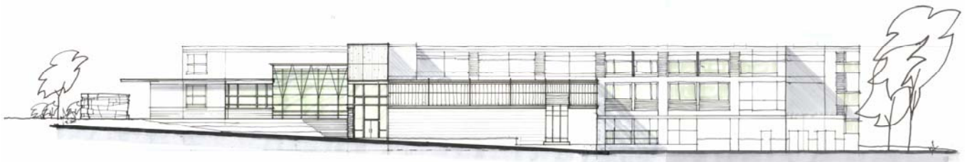
New Carderock Springs Elementary School, coming 2010

Carderock Springs Swim and Tennis Club 8200 Hamilton Springs Court Bethesda, MD 20817