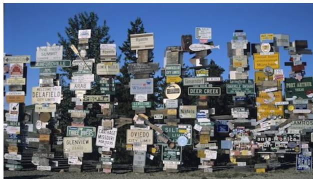
Another neighborhood's signs

Perhaps some of you remember the tune for these lyrics from Five Man Electrical Band. (unbelievably you can get a ringtone for this tune)