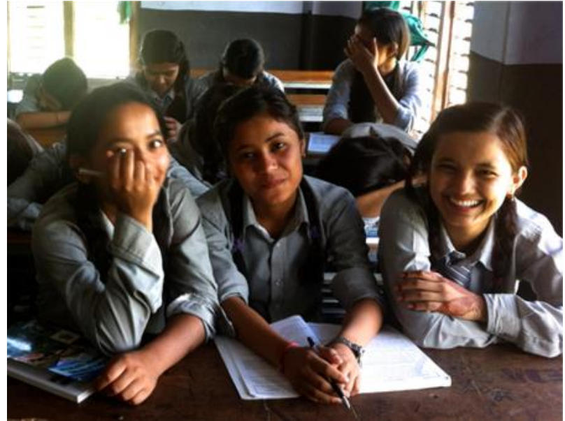
UN Women (2014), Nepal Living Standards Survey (2011)