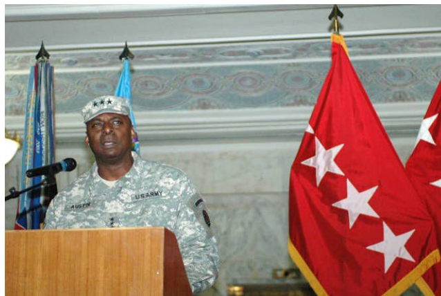
Public Affairs Office, Camp Victory, APO AE 09342

Army's next vice chief of staff. Army Gen. David Petraeus, Multi-National Force Iraq commanding general, spoke highly of Odierno's accomplishments and leadership as commander of III Corps and MNC-I.