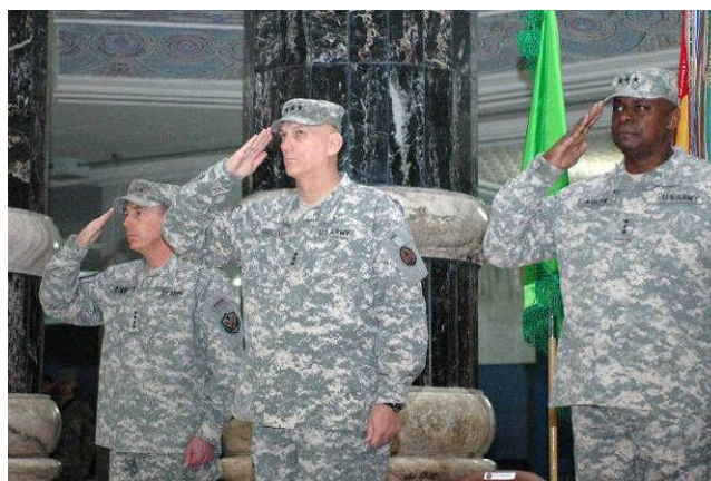
Gen. Petraeus, Multi-National Force Iraq commanding general, Army Lt. Gen. Ray Odierno, III Corps commander and Army Lt. Gen. Lloyd J. Austin III, Multi-National Corps-Iraq commander salute the colors during a playing of 'The National Anthem.'

Austin said he looks forward to working alongside the Iraqi security forces, who share ideals similar to those of Coalition Forces. "Iraqis, like the Coalition soldiers by their sides, believe that there are ideals and responsibilities that transcend the individual, and they are denying the terrorists the freedom to launch their attacks from their neighborhoods," Austin said. "Every day, Iraqis are getting involved with the government." Austin previously served in Iraq from in 2003 as assistant division commander (maneuver) of 3rd Infantry Division (Mechanized). Other assignments include commander of Combined Joint Task Force