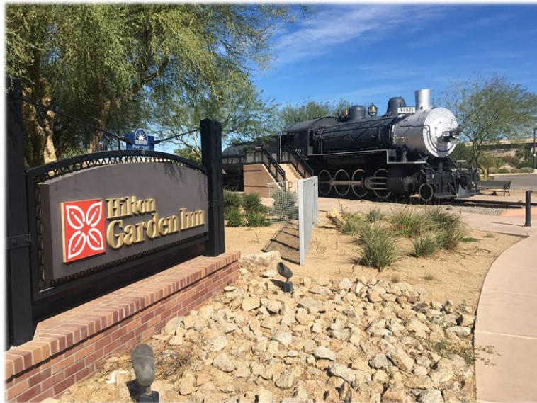
Pivot Point Conference Center and Hilton Garden Inn

Note: Room rate of $139 (plus taxes and fees) available at Hilton Garden Inn in Yuma, AZ