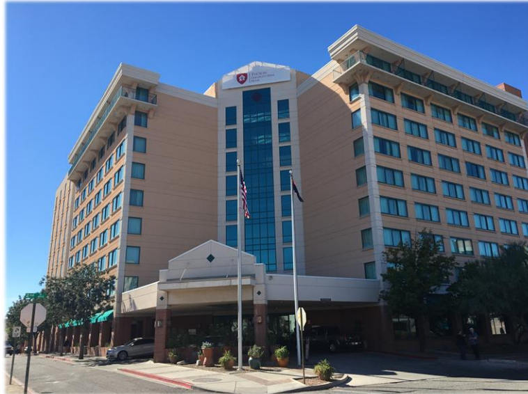
Tucson Marriott University Park Hotel

Note: Room rate of $135 (plus taxes and fees) available at Tucson Marriott University Park Hotel Reserve your room by calling (520) 792-4100.