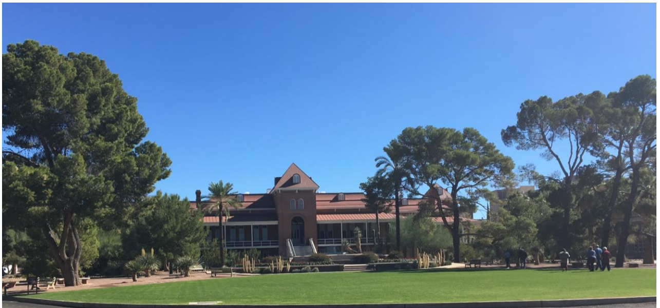
University of Arizona "Old Main"