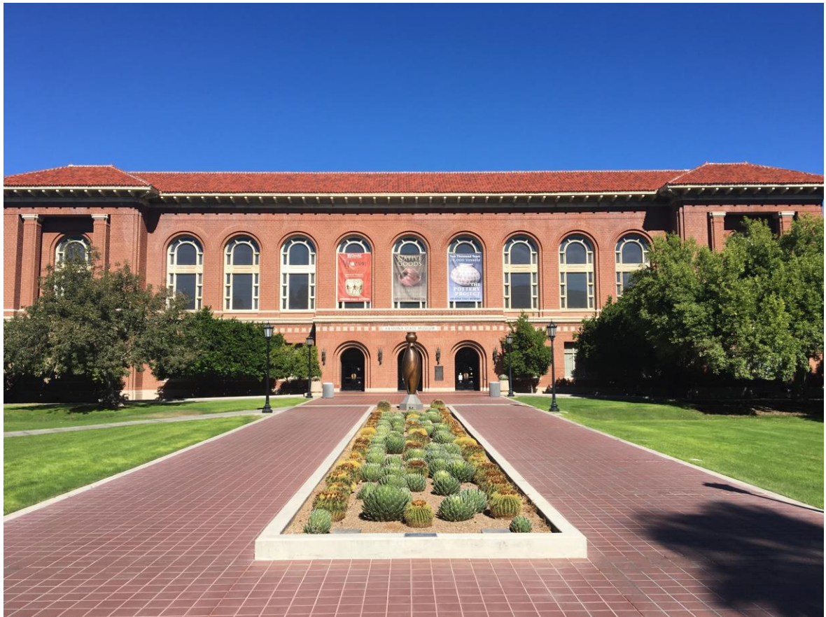
Arizona State Museum