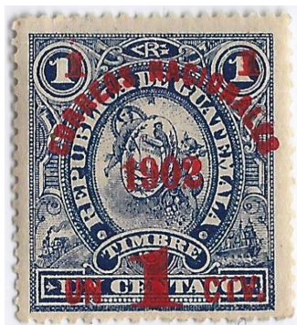
Genuine Surcharges with Red Ink