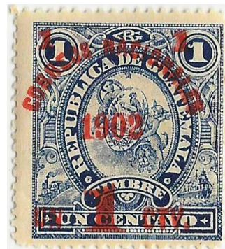
Fake Surcharge with Orange-Red Ink