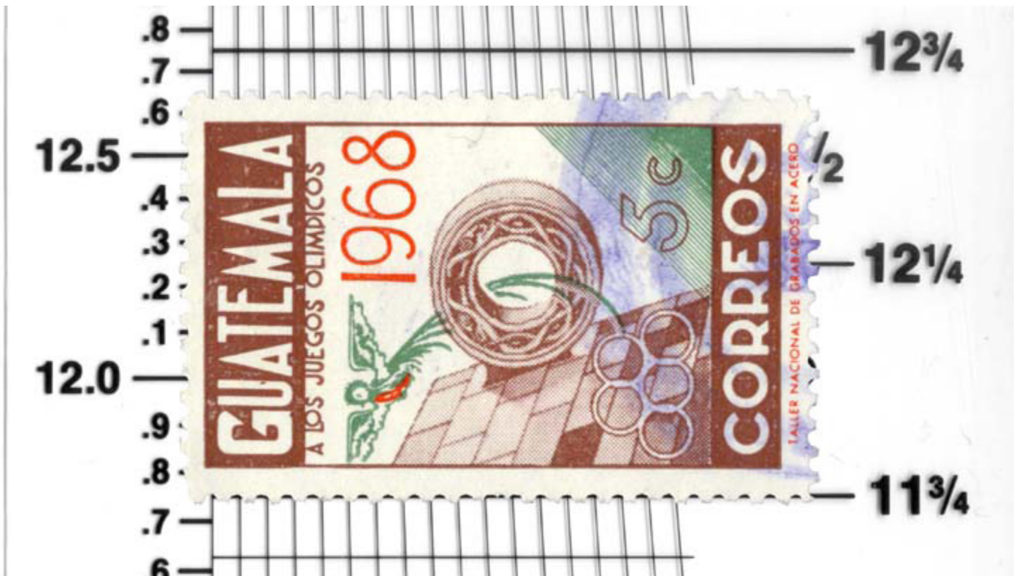
Fig. 3 Scott #414 (ISGC #1140) Superimposed on BSG Unlisted perf 12.6+