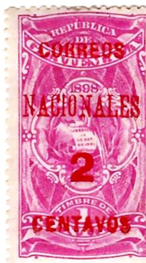
ISGC No. 100