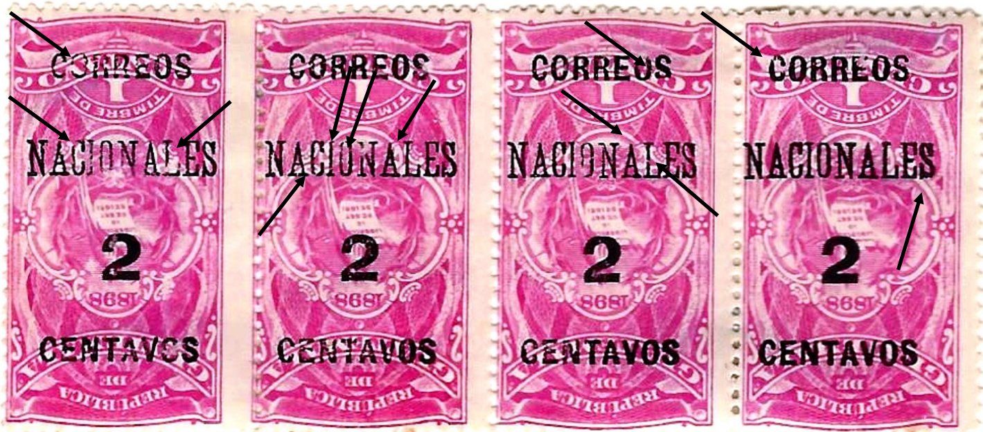
Fake Type A7