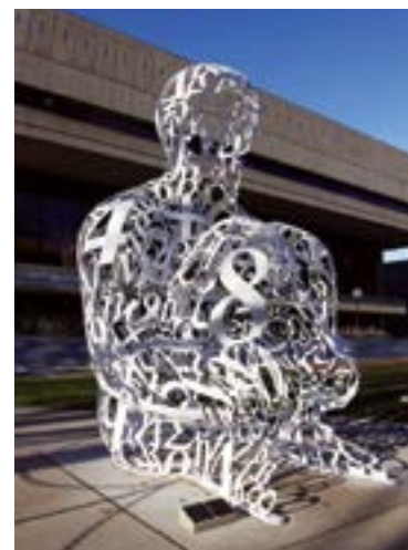
"Alchemist" sculpture by Jaume Plensa

Line to Central Square and then the #1 bus towards Kendall Square. The bus stops in front of 77 Massachusetts Avenue. BHV members and their guests. Free.