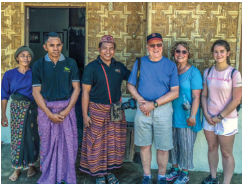
Travel Group: Three Bermans in Indonesia