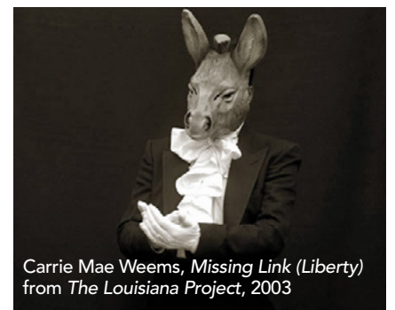
Carrie Mae Weems, Missing Link (Liberty) from The Louisiana Project , 2003

Carrie Mae Weems: Strategies of Engagement at the McMullen Museum at Boston College comprises 124 multi-media works from the artist's innovative 30-year career. The show investigates cultural identity, sexism, class, politics, and