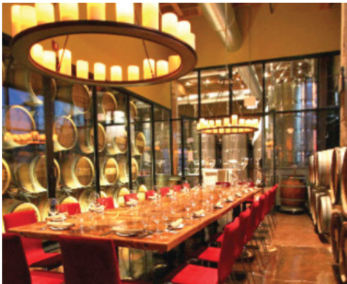
Lunch Group: City Winery