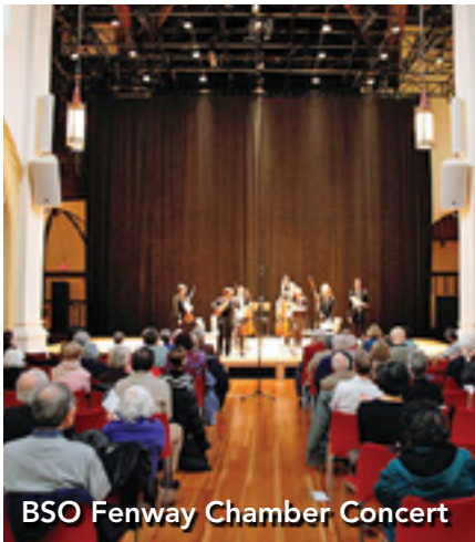
BSO Fenway Chamber Concert