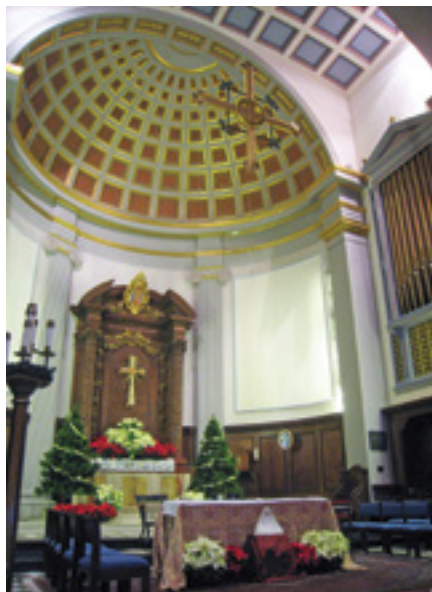
Cathedral Church of St. Paul