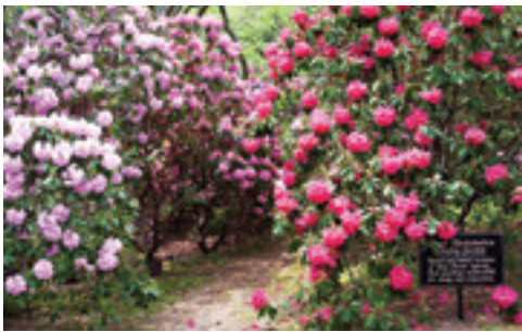
Heritage Museums and Gardens

Located in Sandwich, MA, Heritage Museums and Gardens is known for its internationally important collections of rhododendrons, many of which should be in bloom during our visit. In addition to the Gardens, the Museums contain three galleries: Painted Landscapes: Contemporary Views features American landscape paintings in a variety of media from 49 of the country's best contemporary painters; American art and artifacts; and a collection of American automobiles in a replica Shaker Round Barn. After our guided tour of the gardens, we'll have a boxed lunch, with time to explore the galleries on our own. Van departs Café Tatte, 70 Charles Street, at 9 a.m., or Starbucks, 165 Newbury Street (between Dartmouth & Exeter), at 9:05 a.m. BHV members: $80. Non-members: $95. Price includes van transportation, admission to and tour of the Museum and Gardens and a boxed lunch.