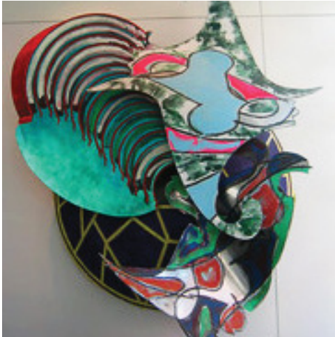
MIT Public Art Tour: Frank Stella's Heads or Tails

Discover hidden highlights from the MIT List Visual Arts Center's public art collection on our private guided tour. View artworks by renowned modern and contemporary artists, including Frank Stella, Leo Villareal, Pablo Picasso, Sol LeWitt, and more. Possibility of lunch after the tour. Meet at the Kendall Square T Station at 10:15 a.m. for the short walk to the List Center, 20 Ames Street, where our 10:30 a.m. tour will begin. BHV members and their guests. Free.