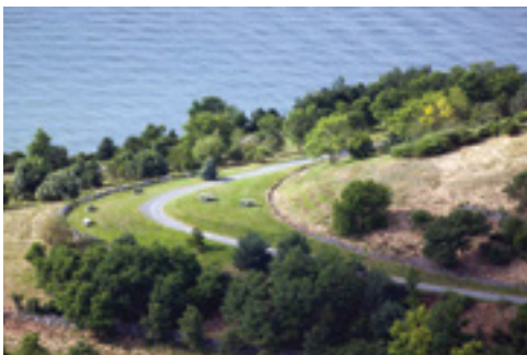
Spectacle Island Ferry & Walk

Just 20 minutes from Boston, Spectacle Island is home to the highest point in the harbor, the North Drumlin, with panoramic views of the city and islands. Now a spectacular public park with a public marina and Visitor's Center, the Island once was home to two hotels, a horse rendering plant and a garbage dump. After our short ferry ride, we'll set out for a hike on some of the Island's