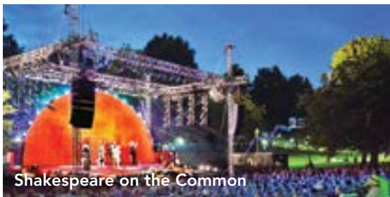
Shakespeare on the Common

reserved, so plan on arriving at about noon to help save tables for our group and to leave time to purchase lunch at the Map Room Cafe. BHV members and guests. Free.