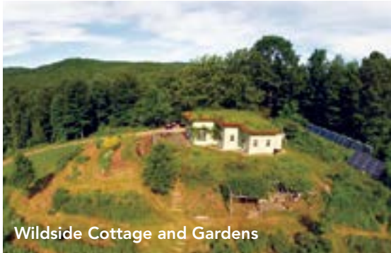
Wildside Cottage and Gardens