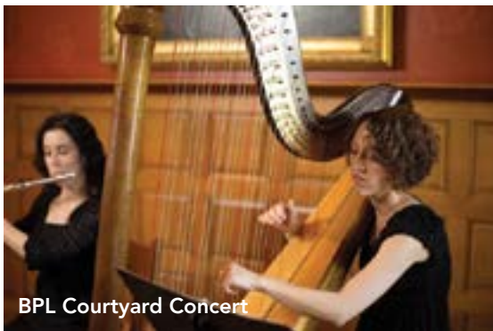
BPL Courtyard Concert