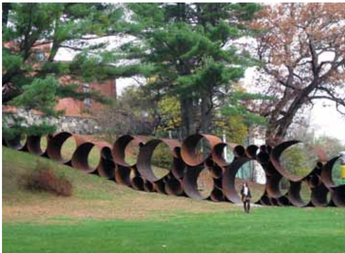
deCordova Museum Sculpture Garden