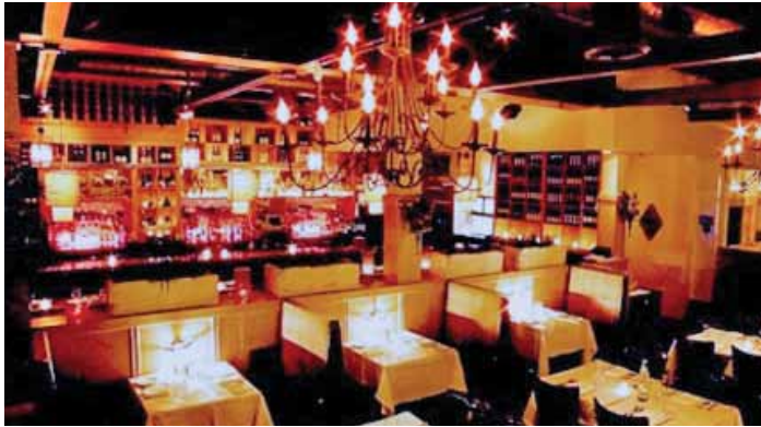
Brunch at Masa