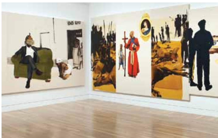
Example of Meleko Mokgosi's work – entitled "Bulletproof"

Botswana, the New York-based artist creates scenes that investigate Southern Africa's past and present. Meet at the ICA, 100 Northern Avenue. From South Station, take the Silver Line one stop to the Courthouse. Exit the station onto Seaport Boulevard and walk away from downtown. Just before the first traffic light, there will be a pedestrian opening in the fence on your left – walk through it to the walkway that runs alongside the Chapel of Our Lady of Good Voyage. This will lead you to Northern Avenue. The ICA is across the street to the right. BHV members & guests only. Free admission to the Museum. Lunch is pay individually.