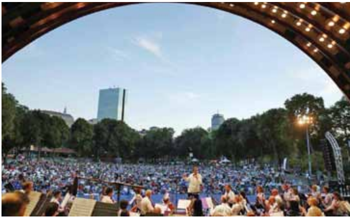
Landmarks Orchestra at the Hatch Shell