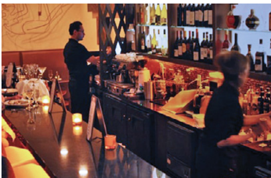
Lunch Group: Piattini

Piattini means small plate in Italian, and their plentiful menu of small plates will allow you to sample a variety of authentic Italian dishes. A Back Bay favorite, Piattini is known for fresh ingredients, delicious wines, and the warm hospitality of its owners. The conversation is sure to be lively (but not too noisy) in our own private dining room. Buon Appetito! Meet at Piattini, 226 Newbury St. Copley on the Green Line is the closest T stop. Pay individually. BHV members only.