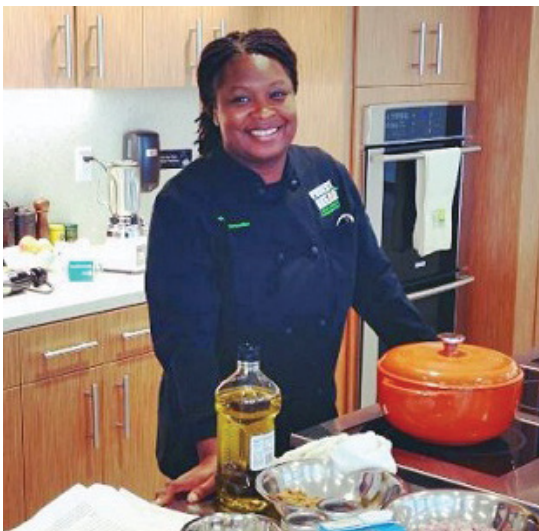
Fresh, Fast and Delicious for Less/Project Bread