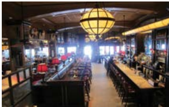
Lunch Group: Eastern Standard