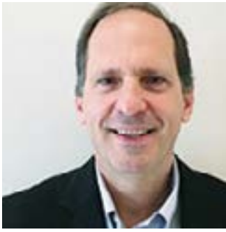
Conversations with... Armond Cohen