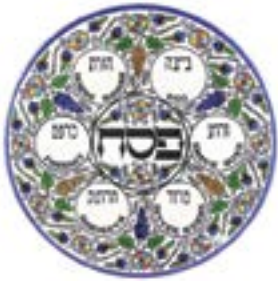
Passover Pot Luck