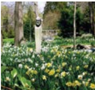
Blithewold Mansion & Gardens