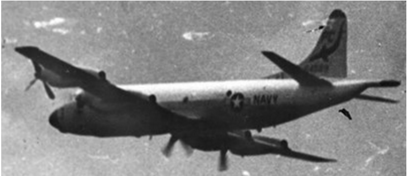
VP-6. Blue Sharks. Pacific 1976-1977. Picture from a Soviet ship "Spassk".

Pulled this from the VP6 facebook page because it is so stinking cool